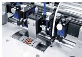
Bottom suction feeder