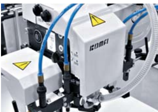
Komfi-design feeding head