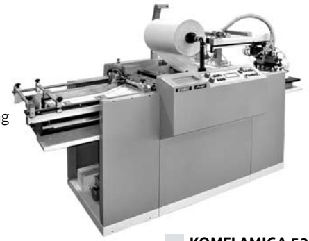
KOMFI AMIGA 52